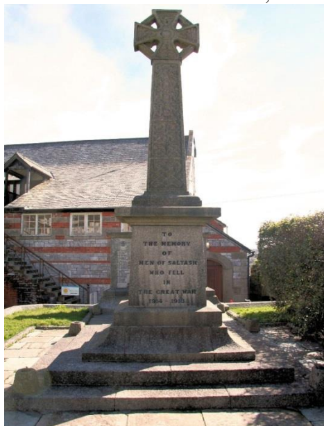
2018 photograph (with dates)