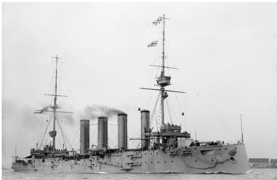
HMS Good Hope

“November 12 th . The Secretary of the Admiralty announced that, in the absence of further information, the loss of H. M. ships Good Hope and Monmouth must be presumed. The Good Hope was the flagship and had on board Rear-Admiral Sir Christopher G. F. M Cradock, K.C.V.O., C.B., and his staff. Her complement consisted of 900 officers and men.”