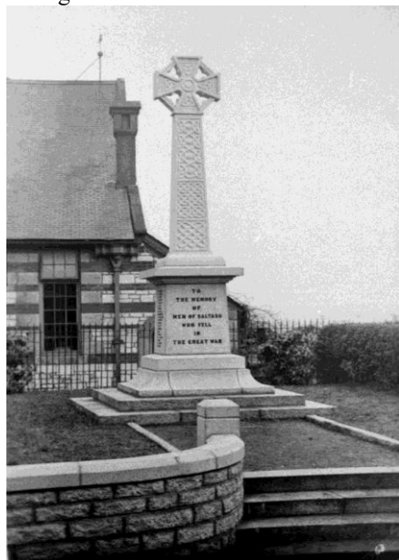
circa 1920 photograph (without dates)

Borough of Saltash Great War Memorial outside St. Nicholas & St. Faith Church, Saltash