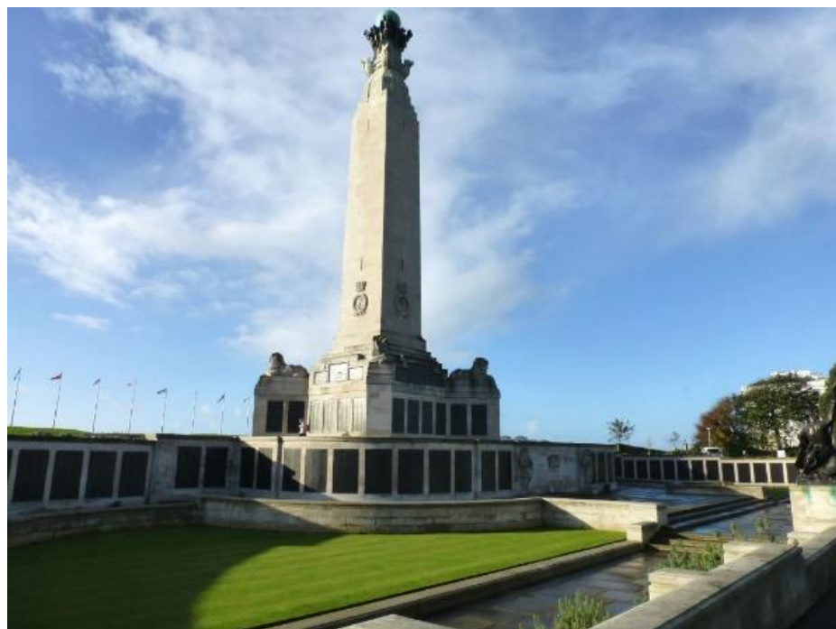
Plymouth Naval Memorial

Borough of Saltash Great War Memorial outside St. Nicholas & St. Faith Church, Saltash