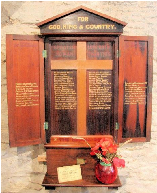
Great War Memorial in St John's Chapel, inside St. Nicholas & St. Faith Church, Saltash.