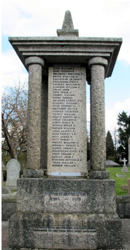
Above .St Stephens by Saltash

Until 1934 'Saltash' and 'St. Stephens by Saltash' were two separate Parishes and each parish had its own Great War, to end all war , War Memorial.